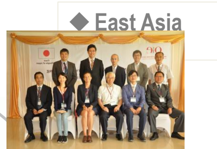
◆ East Asia