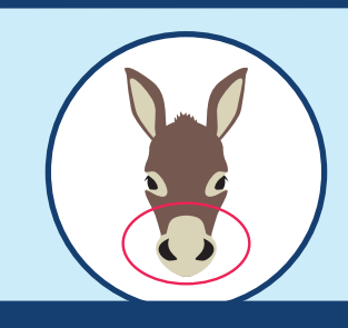
DIFFICULTY BREATHING Widely open nostrils show effort to breathe