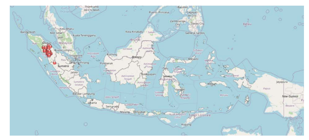
ASF Confirmed Cases (iSIKHNAS)