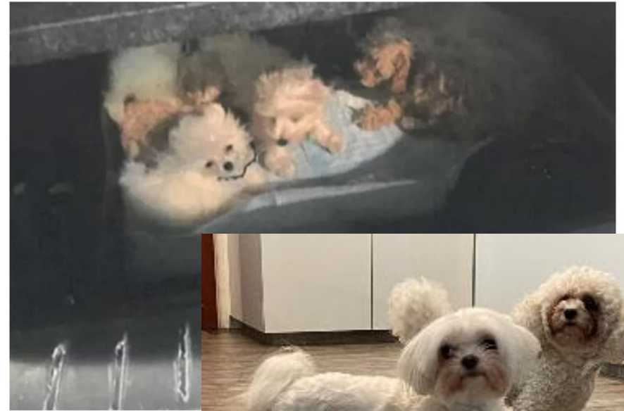
Fifteen puppies were found hidden in the u PARKS BOARD

Over 30 cases of pet animal, wildlife smuggling detected in 2023