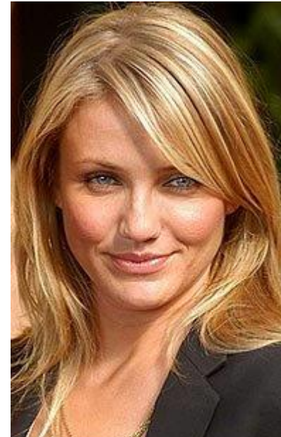
With blonde hair