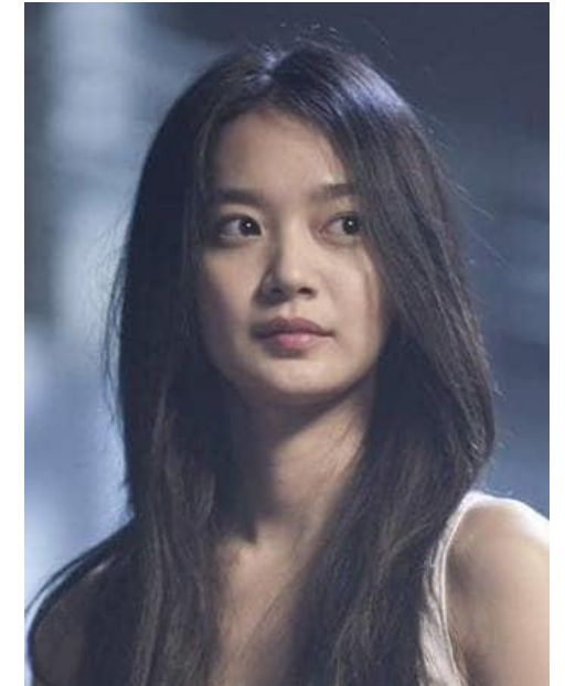
As a Gumiho (nine-tailed fox)