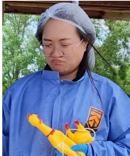
With Fake outbreak chickens