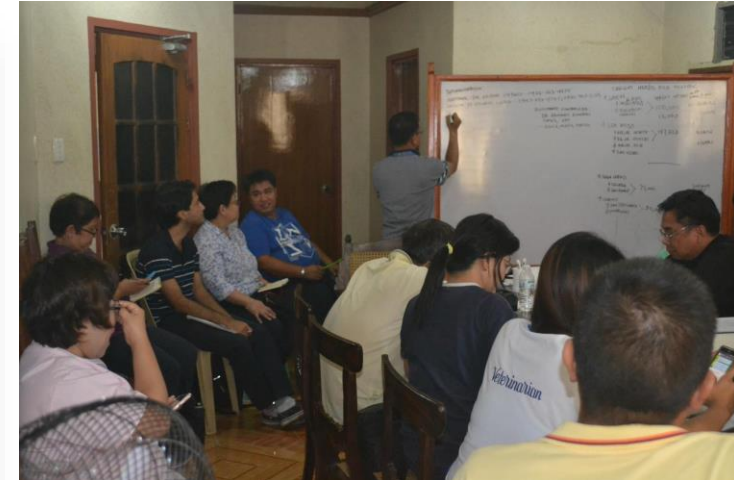
Synchronization meeting, daily at 1 pm