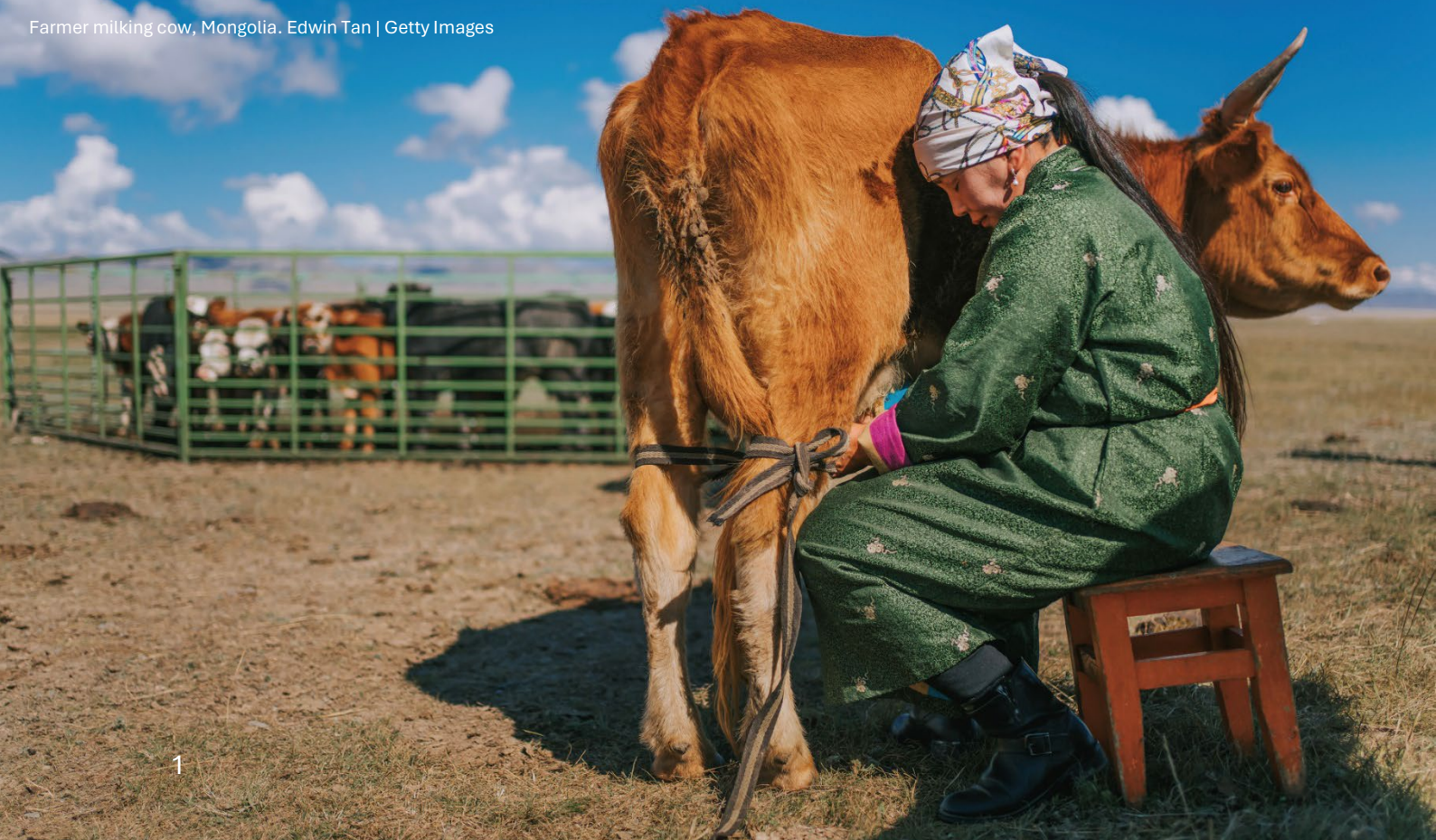
Farmer milking cow, Mongolia.

This Action Plan was developed by the RAWS-AG. The RAWS-AG supports collaboration between regional members and animal welfare stakeholders who share the common vision and support the implementation of activities in this Action Plan. For more information on the RAWS and to see a list of RAWS-AG members and observers, see: https://rr-asia.woah.org/en/projects/animal-welfare .