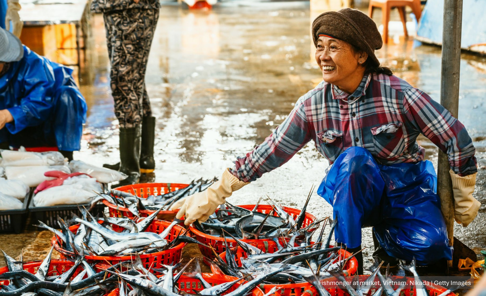
Fishmonger at market, Vietnam.