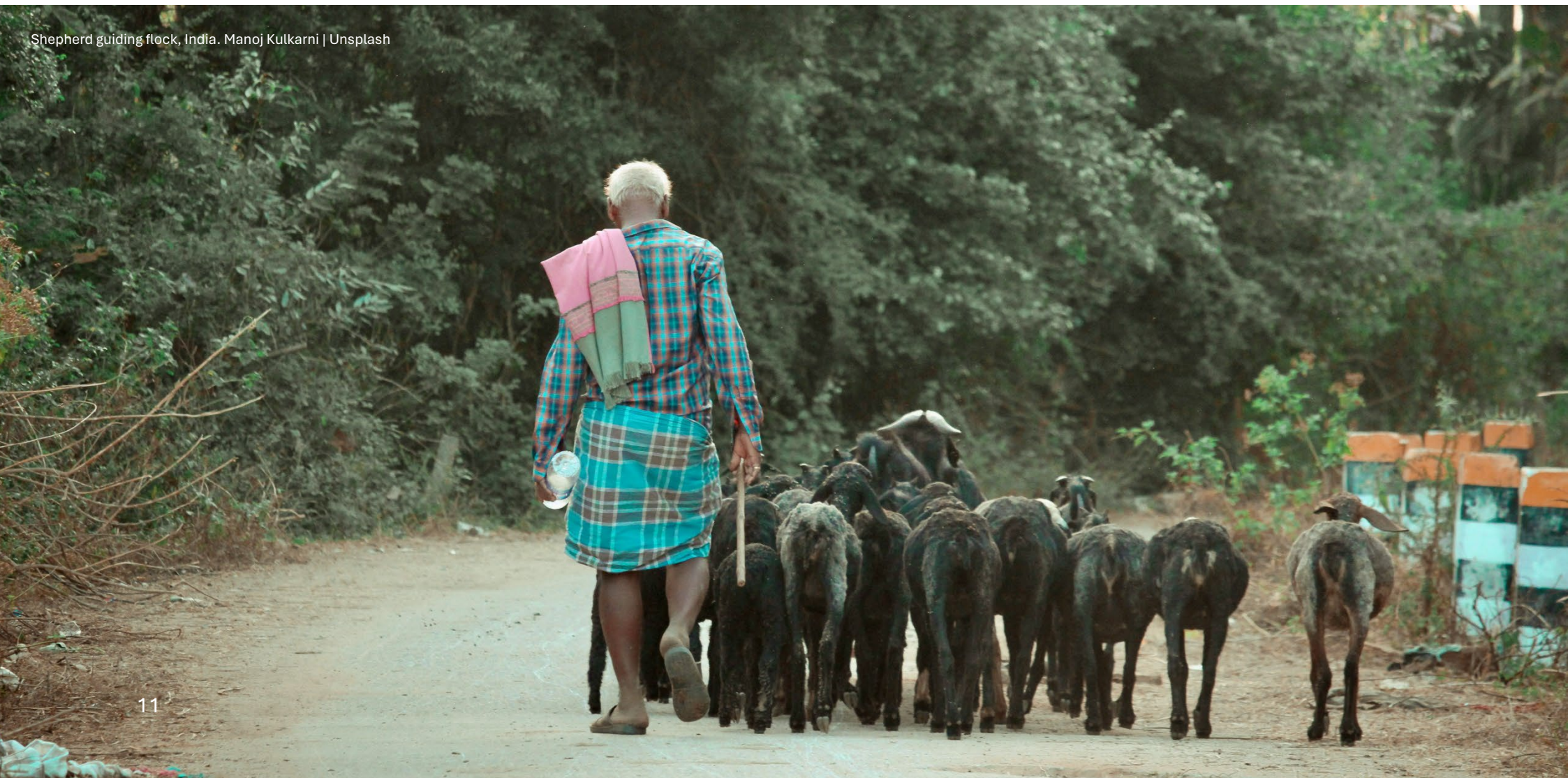
Shepherd guiding flock, India.