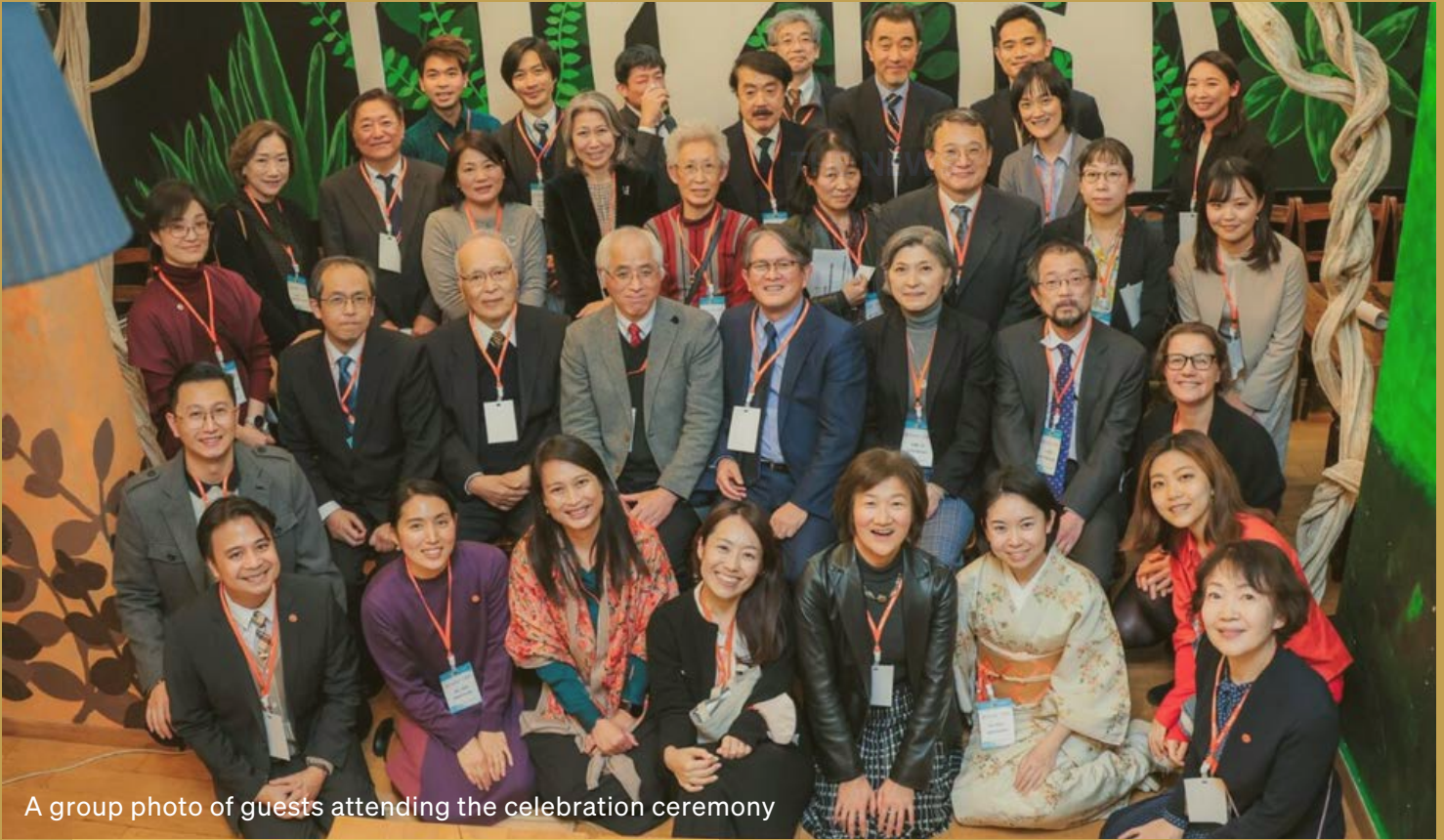
A group photo of guests attending the celebration ceremony

RRAP Tokyo held a modest gathering of local partners, supporters and former staff in Japan at the University of Tokyo, commemorating the 100th anniversary of WOAH.