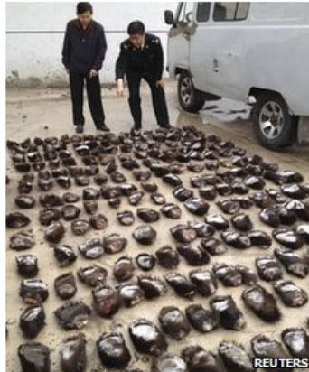
The sale of bear parts is illegal in China, but a thriving trade exists nonetheless.

The vehicle was then X-rayed, the tyres removed and the