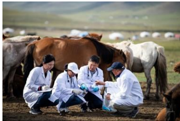
Sampling from nomadic livestock