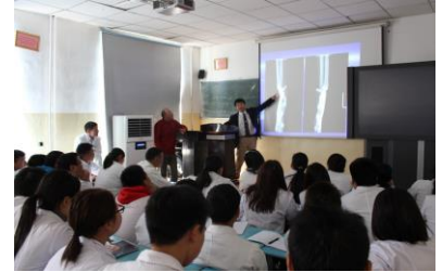
Lecture for undergrad students