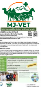
Online course in 2021