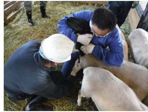
Animals in quarantine