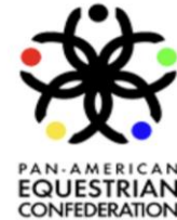
PAEC - Pan-American Equestrian Confederation