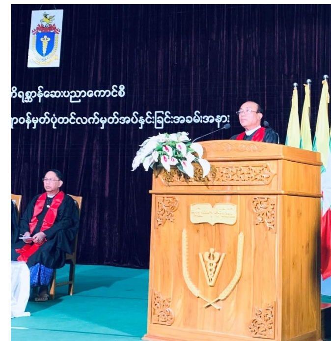
Chairman of MVC Conferring Registration Certificate to New Veterinary Graduates on 24 th Dec 2022