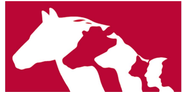
The Ohio State University Evaluation Tool for OIE Competencies of Day 1 Veterinary Graduates