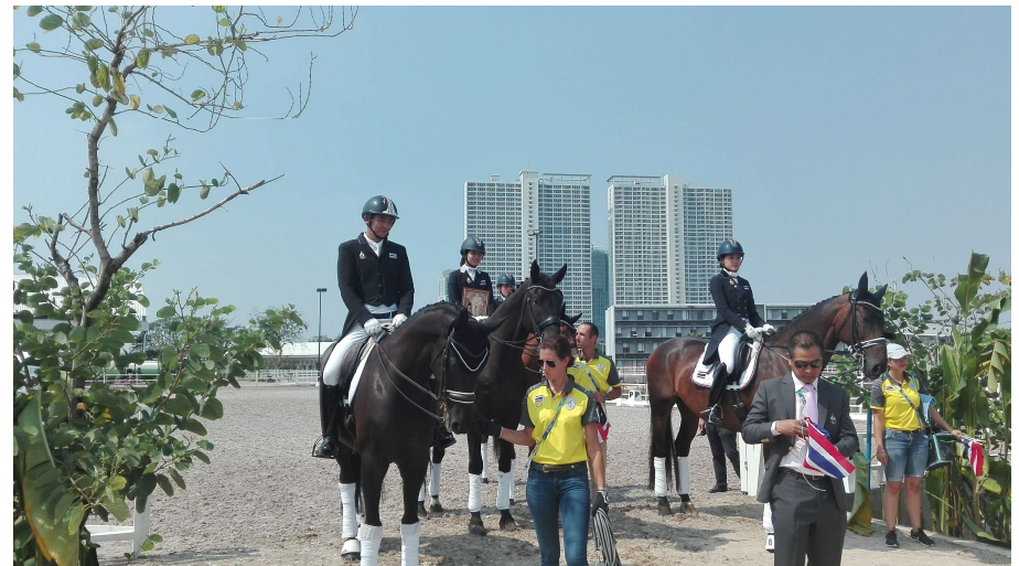
Asian Games, 2018