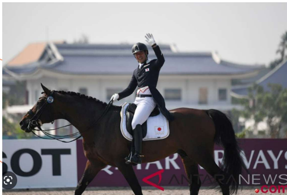
Asian Games, 2018