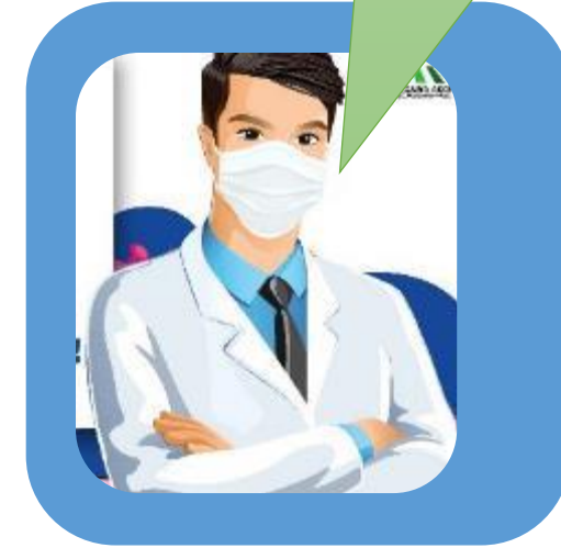
Veterinarians / Policy Makers

Strict border control prevent illegal movement of live pigs and destroy pig products at country entry points prevents introduction of the virus.