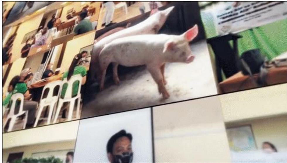
Interview featuring the best practices done by LGUs in Batangas to declare their ASF-free status ➤