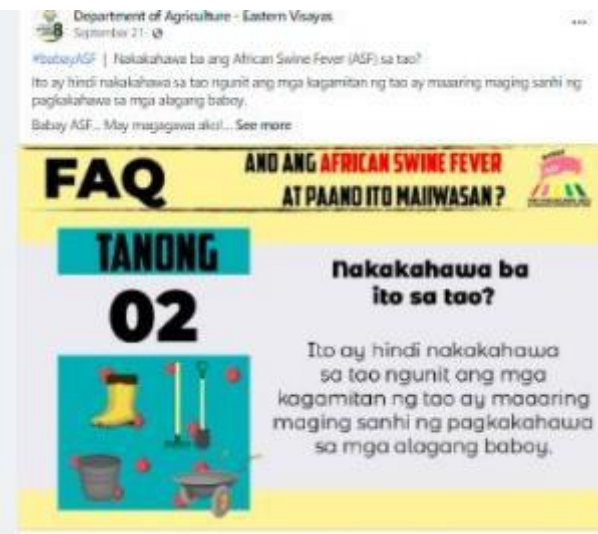
Social media cards