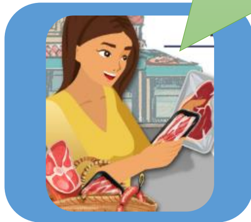
General public / Consumers

Do not bring pork & pork products during travels.