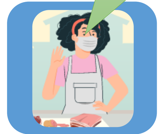
Vendors / Online meat sellers

Biosecurity measures. Comply with meat inspection requirements & certification