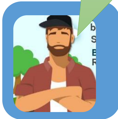
Hog traders / Viajeros

ASF is contagious & deadly to pigs. Strict biosecurity measures. Observe & comply with border control requirements