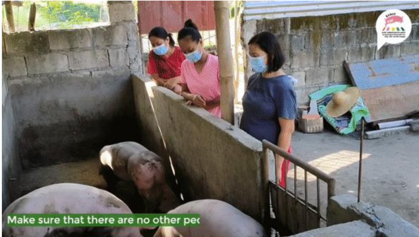
Filming of biosecurity video in a backyard farm in Pampanga ➤