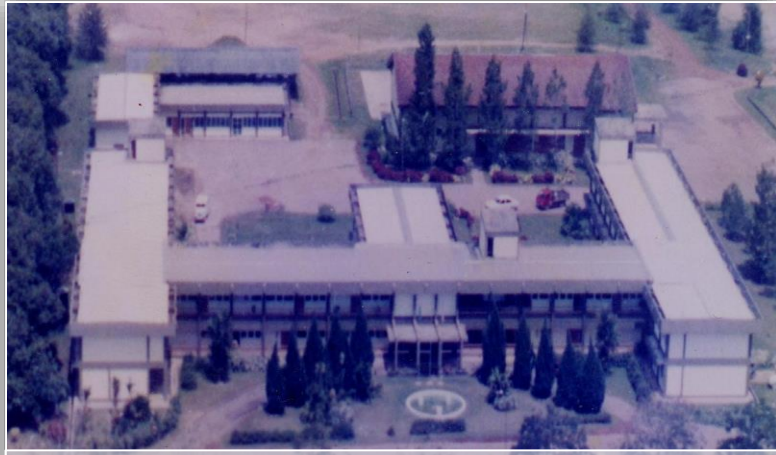
VETERINARY TRAINING CENTRE (VTC)