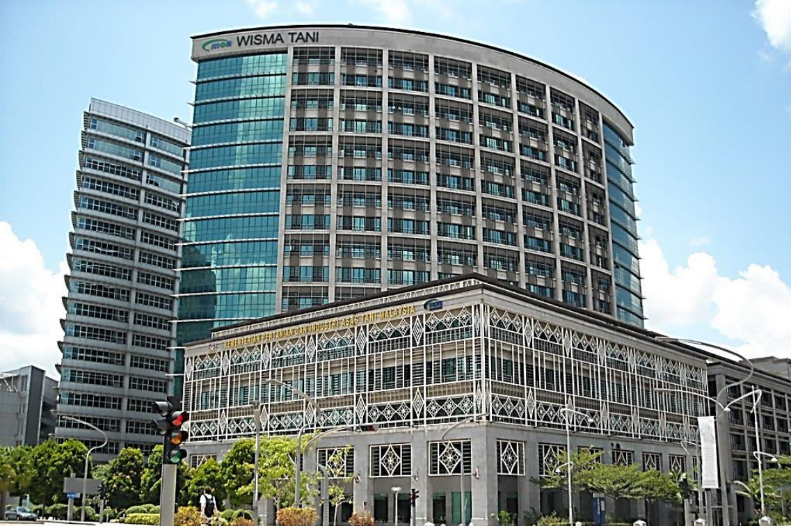
MINISTRY OF AGRICULTURE AND FOOD INDUSTRY DVS HEADQUARTERS, PUTRAJAYA