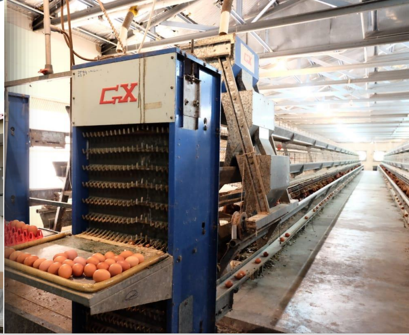
ESTABLISHED JULY 2007 12 Ha Training Facilities, Poultry Farms, Hatchery