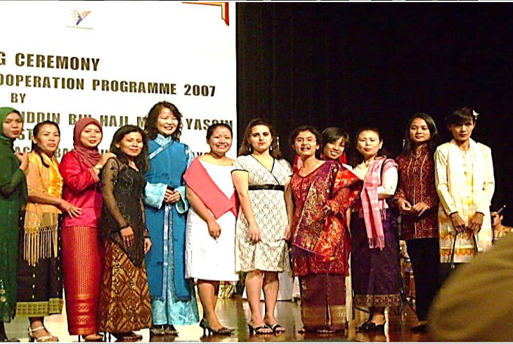
Malaysian Technical Cooperation Program (MTCP)