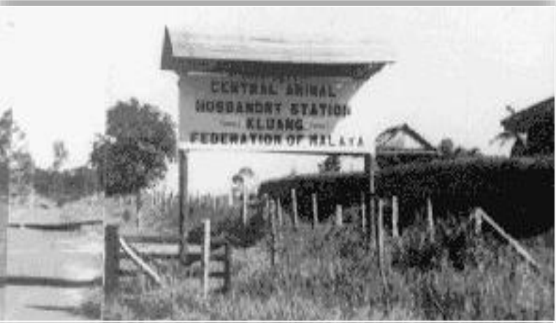
CENTRAL ANIMAL HUSBANDRY STATION (CAHS)