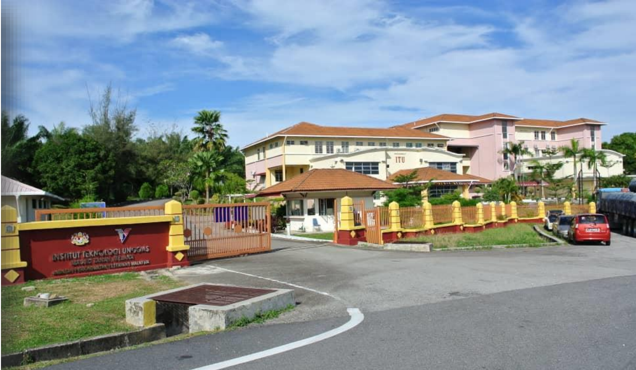
INSTITUT TEKNOLOGI UNGGAS, MELAKA (POULTRY INSTITUTE OF TECHNOLOGY, MALACCA)