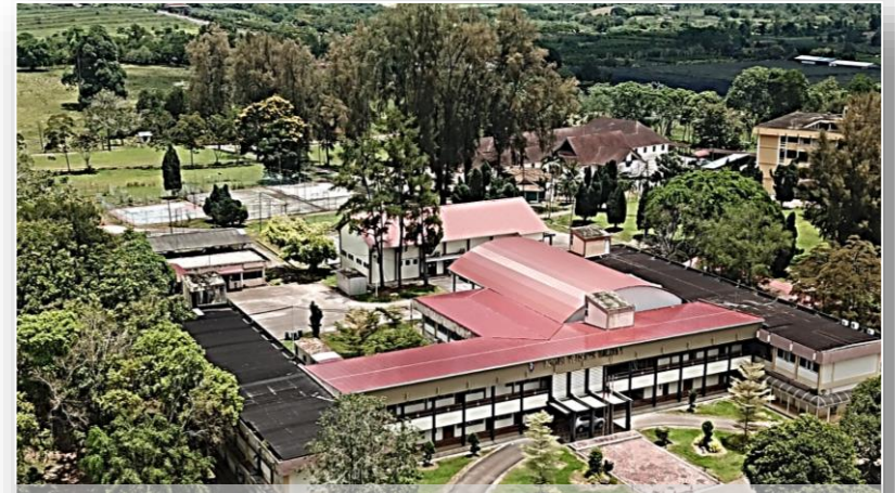
INSTITUT VETERINAR MALAYSIA (IVM)