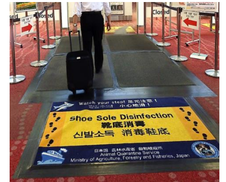
Shoe sole disinfection mat in airport