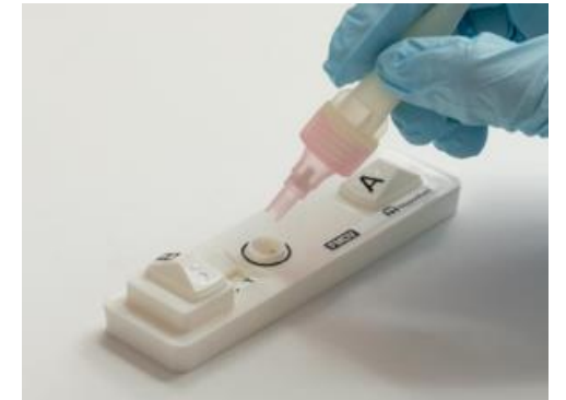
antigen-capture kit