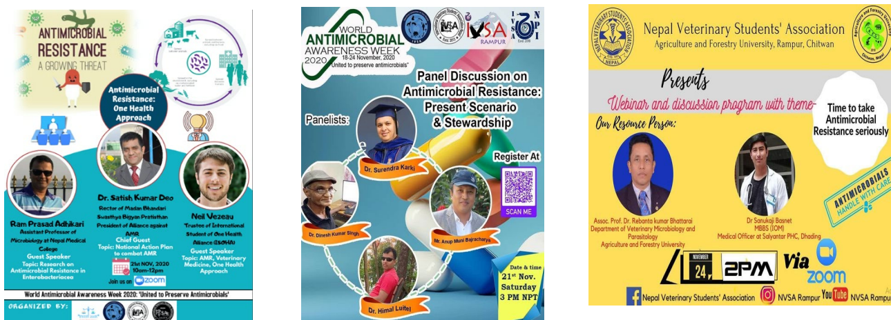
Figure 4: Banners of various webinars organized by veterinary students’ associations on the occasion of WAAW 2020.

The Nepal Veterinary Students’ Associations, and the International Veterinary Students Association in Nepal also organised webinars (Figure 4) on AMR during the WAAW 2020.