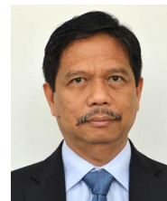
Ronello Abila OIE Sub-Regional Representative for South East Asia