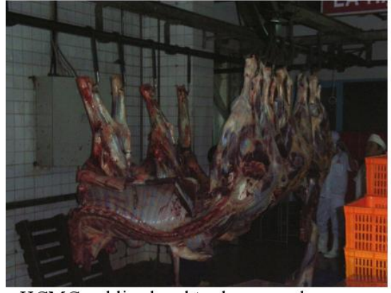
HCMC public slaughter house and cannery

The newer abattoirs seem to be having some success in attracting farmers away from traditional or outdated methods and consumers seem happier that there has been an improvement in quality. These new abattoirs adhere to much better standards of hygiene and one poultry establishment visited had implemented a system of ozone treatment of their products and a good packaging system including disinfection of boxes before marketing. A number use waste for biogas generation. A very new privately owned export abattoir visited is of a very high standard with the main enterprise being the export of 6-10Kg suckling pigs to Hong Kong. Larger pigs are also slaughtered for domestic consumption. Further encouragement of this type of enterprise would reduce the problems in many areas.