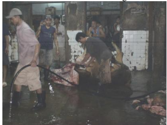
a provincial city slaughter house

At communal level, food inspection is said to be done by the communal veterinary para-professionals, some of them trained only for a few days or weeks. They obviously don't have any real knowledge of food inspection. Asked about this, one answered that their training was only about "quality" to discriminate the meat into "categories" which were "one day, two days, three days".