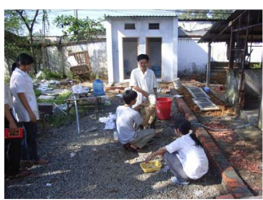
Students' practical exercise on sheep