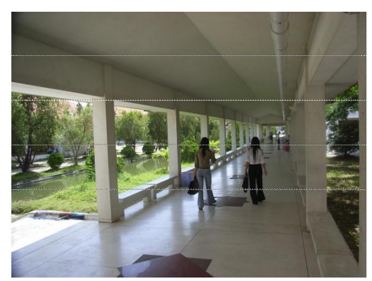
Can Tho University

Each University visited had a small animal clinic but there are very limited opportunities for students to gain practical experience with farm animals.