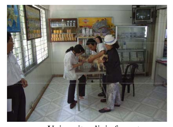
University clinic for pets

Each University visited had a small animal clinic but there are very limited opportunities for students to gain practical experience with farm animals.