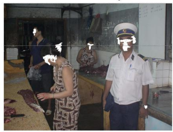
inspection (seldom) carried out with a pen, a few knifes and stamps