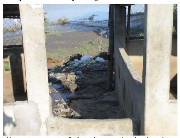
direct wastage of slaughter point in the river