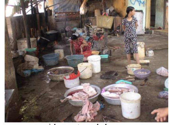
an aside meat workshop