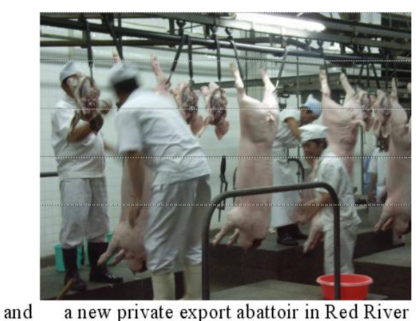
a new private export abattoir in Red River