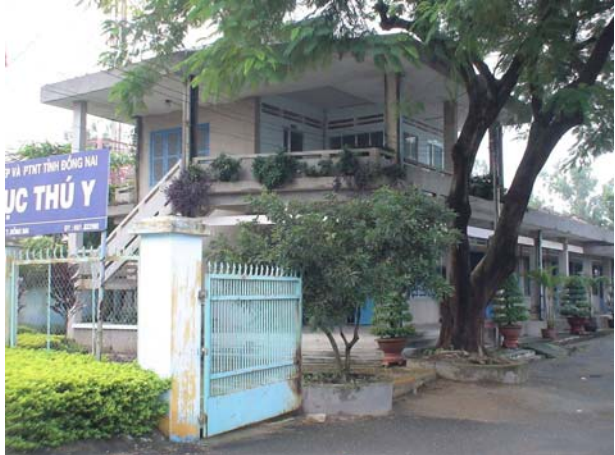
Provincial Sub DAH buildings