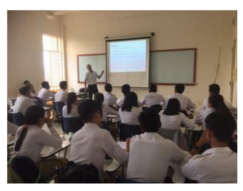
Physical Examination of large Animal-Basic approach for diagnosis by Prof HIsashi INOKUMA