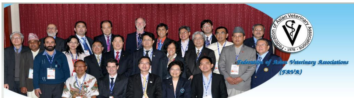
Attendees of the 17 th FAVA Congress, Taipei, Taiwan

The 17 th Federation of Asian Veterinary Associations (FAVA) Congress was held in Taipei, Taiwan on the 4 th of January, 2013. Attended by over 1,000 delegates from around the world including 13 FAVA council member countries, the Congress saw the exchange of reports and presentation's of each country's veterinary professions, including education, numbers, structure and current issues. From these presentations, the vital role of the veterinarian in agriculture and aquacultures industries was emphasised as well as the issue of animal welfare in regards to production animals.