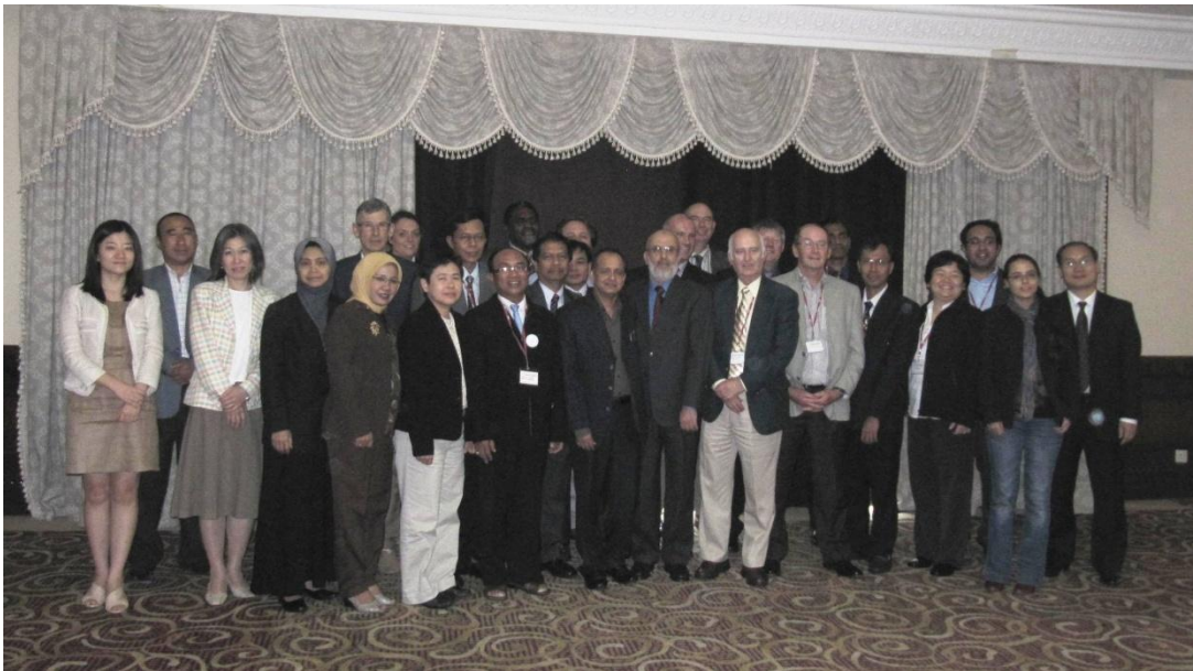
Photo: RAWS Coordination Group and selected Animal Welfare Focal Points